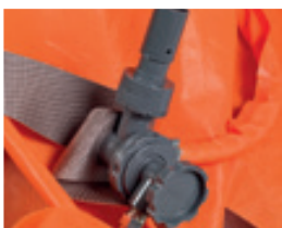
AlphaTec® flow-control valve and low-flow alarm unit