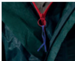
Double zip system