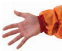
Double cuff design