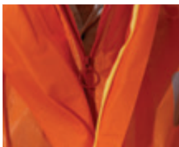
Double zip system