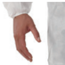
Elasticated wrists, waist and ankles