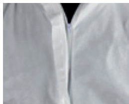
2-way front zip