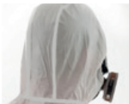
Elasticated 3-piece hood