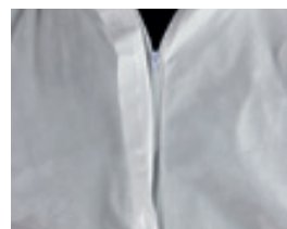
2-way front zip