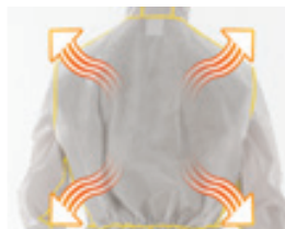
Breathable SMS back panel