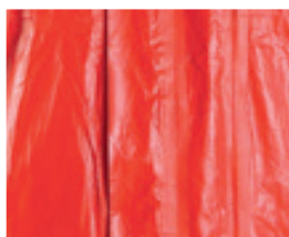
Double zip closure